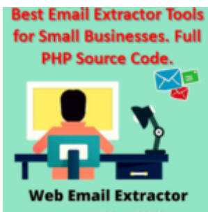
Web Scraper and Email Extractor Software