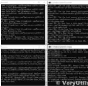
Email Finder is the Fastest Way to Find Email Addresses from websites