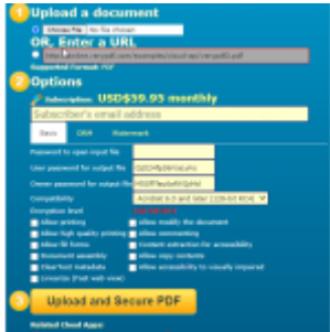
Digital Rights Management for PDF Files & Documents – VeryUtils PDF DRM Solution