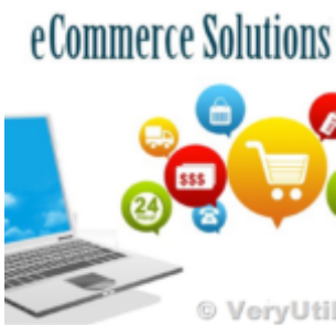
eCommerce solution - Enterprise eCommerce platform based on OpenCart