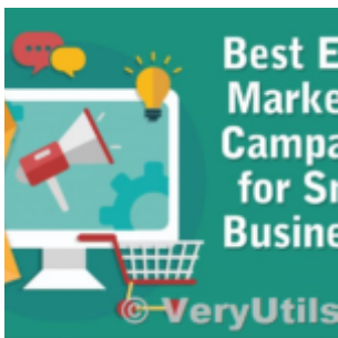
Best Email Marketing Solution with SMTP Rotation, Rotate on multiple SMTP Servers automatically