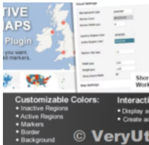
Unlocking Data Insights with VeryUtils Interactive SVG Map Component