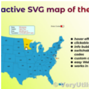
VeryUtils Custom Interactive Map HTML5 Plugin