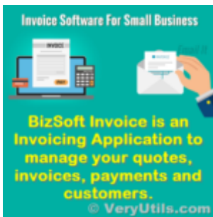
VeryUtils Online Invoices: Online Billing & Invoices Management Software