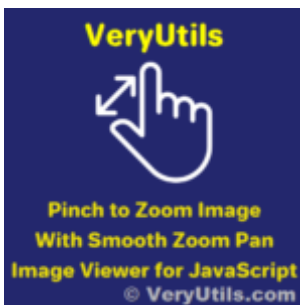
VeryUtils Smooth Zoom Pan Image Viewer for JavaScript