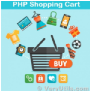
Simple Shopping Cart using PHP and MySQL

VeryUtils Video Player is the most advanced video player ever created! | 5