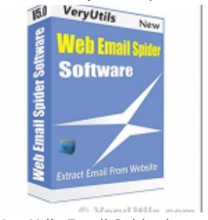
VeryUtils Email Spider is an Email Crawler, Email Address Crawler and Extractor