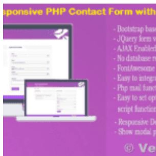
VeryUtils Responsive PHP Contact Form with jQuery AJAX