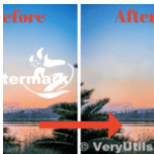
VeryUtils Free Photo Watermark Remover -- Easily remove watermark from images online and free with V...