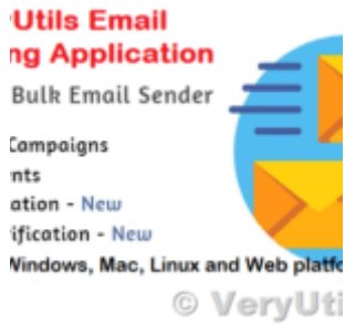
VeryUtils Email Marketing Application with Multiple SMTP Rotation