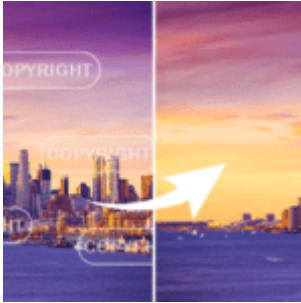
Remove Logo from Picture Automatically with VeryUtils Free Watermark Remover Online

VeryUtils SmallPNG is the ultimate tool for optimizing your website's PNG images, reducing file sizes by up to 80% while maintaining quality | 6