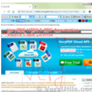
VeryUtils provides source code license for HTML5 PDF Annotation Web application