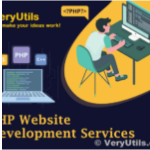
VeryUtils Custom Development Service for PHP Script Modification