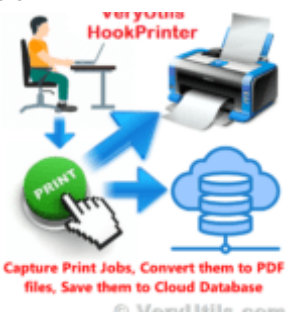
We need a Printed Documents Capture Software