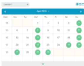
PHP Booking and Appointment Scheduler © VeryUtils.com