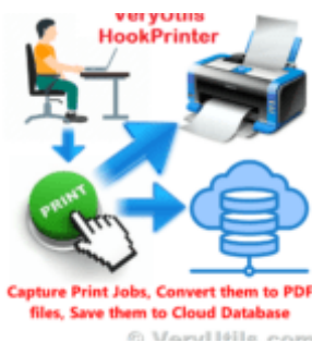
We need a Printed Documents Capture Software