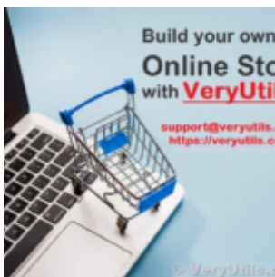
Build your own Online Store with VeryUtils to sell your Digital Products and Physical Products onli...