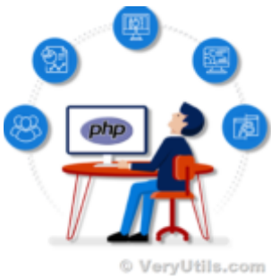
VeryUtils Remotely Hosted Scripts Service -- SaaS