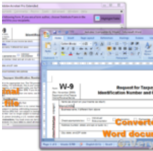
PDF to Word Conversion SDK