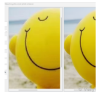
VeryUtils Al-Powered Photo Enhancer can be used to Fix Pixelated Image, Increase Photo Resolution