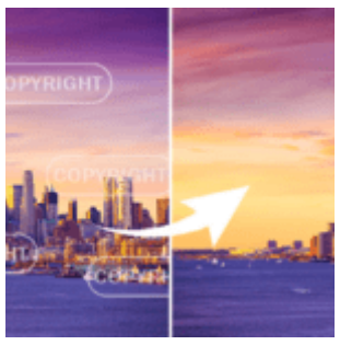
Remove Logo from Picture Automatically with VeryUtils Free Watermark Remover Online