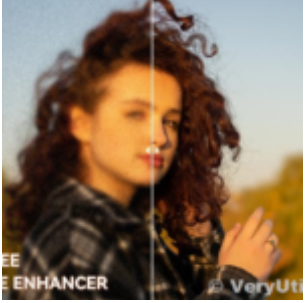
Free VeryUtils AI Photo Enhancer: Register Now & Get 1 Month Free Subscription!