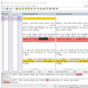
VeryUtils PDF Comparer is the Best Document Comparison Software for Desktop on Windows system