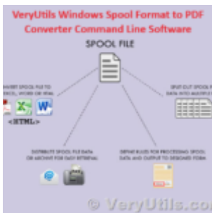
VeryUtils Windows Spool Format to PDF Converter Command Line Software