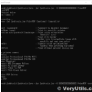
A Royalty Free jPDFPrint Command Line for developers