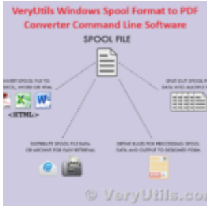
VeryUtils Windows Spool Format to PDF Converter Command Line Software