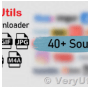
VeryUtils All in One Video Downloader Script