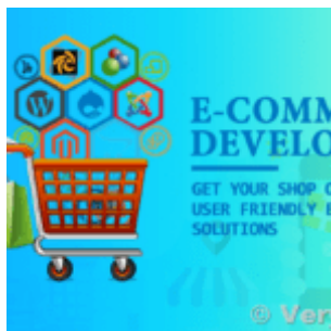
VeryUtils provides Customized Development Service for Online Store Builder PHP Script