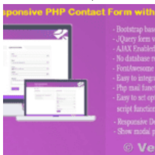
VeryUtils Responsive PHP Contact Form with jQuery AJAX