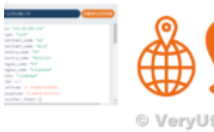
Best and Free IP Geolocation API and Accurate IP Lookup Database