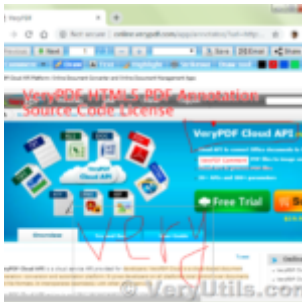
VeryUtils provides source code license for HTML5 PDF Annotation Web application