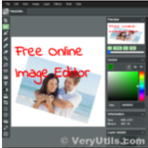
VeryUtils Online Photo Editor is a Free Online Photo Editing & Image Editor