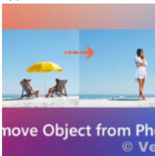
VeryUtils Free AI Photo Object Remover is a Convenient Online Tool to Remove Watermarks from Photos