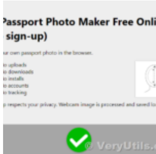
VeryUtils AI Free Online Passport Photo Maker (No Sign-Up)