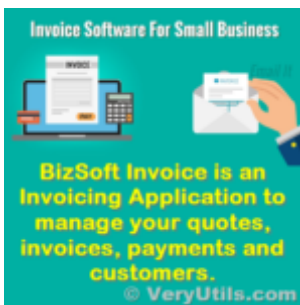
VeryUtils Online Invoices: Online Billing & Invoices Management Software