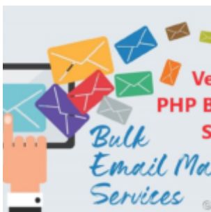
Bulk Email Marketing Web Application For Business with VeryUtils PHP Batch Email Sender