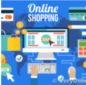
VeryUtils PHP Script for Ecommerce Shopping Platform and Online Ordering System