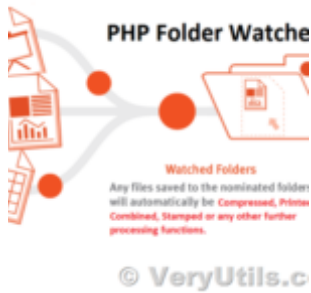
What are the benefits of PHP Folder Watcher software?