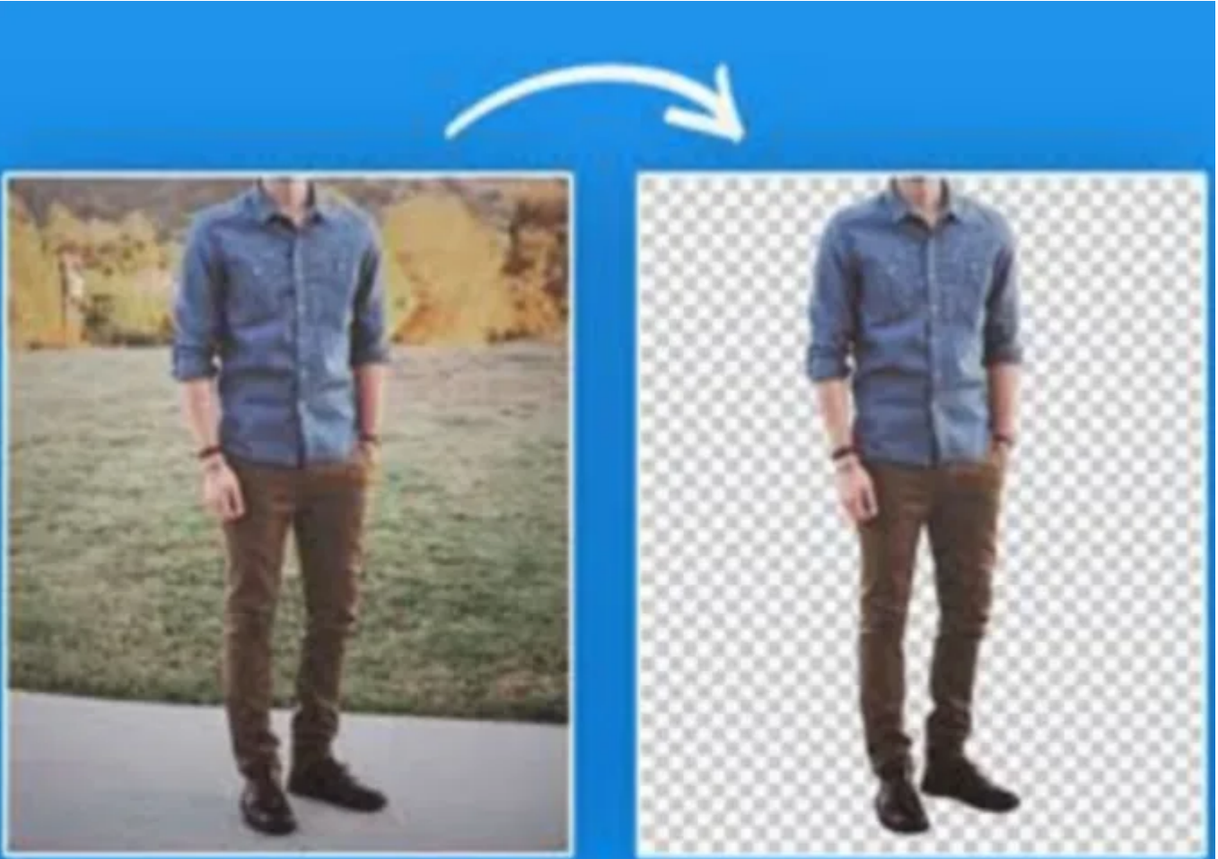
IMAGE BACKGROUND REMOVER