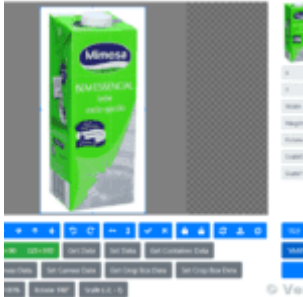
VeryUtils Image Crop and Upload using jQuery with PHP Ajax