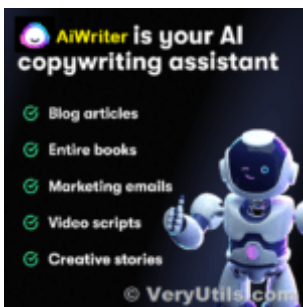
VeryUtils AiWriter Tool is a powerful AI Content Generator Tool And Writing Assistant