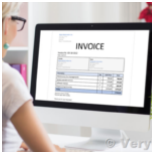
Best PHP Invoice Manager for Developers and Small Businesses