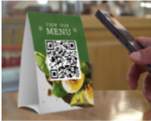
VeryUtils QR Code Menu Solution For Restaurants, Bars, Hotels, etc., Build a contactless QR Menu for your restaurant today! © VeryUtils

VeryUtils Email Marketing Software is a powerful self-hosted email marketing application that helps you send emails beyond limits | 5