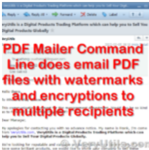
Batch send emails to clients with VeryUtils PDF Mailer Command Line software