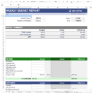
Add Web Excel to Your Web Applications with VeryUtils Js spreadsheet: The Ultimate JavaScript Data Grid