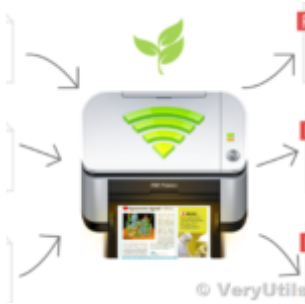
ImagePrinter Converts PDF and other office documents into various formats