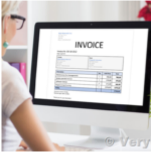
Best PHP Invoice Manager for Developers and Small Businesses

VeryUtils Easy Barcode Generator Software is a barcode encoding library supporting over 50 barcode types | 10