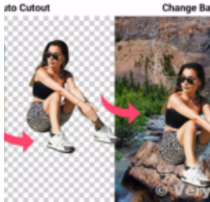
Remove and change background from images with VeryUtils Image Background Remover

VeryUtils Background Eraser does remove image backgrounds automatically | 5