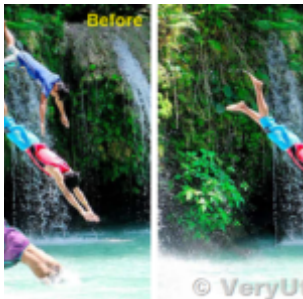
VeryUtils AI Image Object Eraser Software for Windows 10 & 11