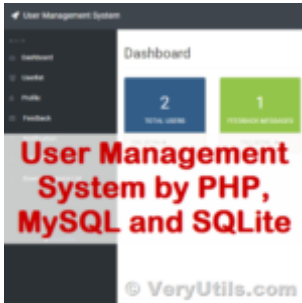
VeryUtils User Management PHP Scripts