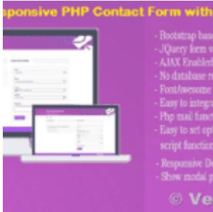
VeryUtils Responsive PHP Contact Form with jQuery AJAX