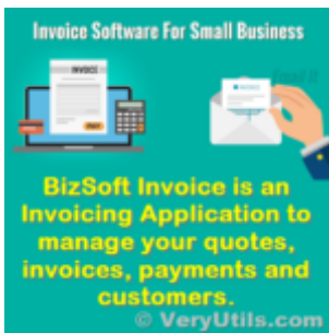
VeryUtils Online Invoices: Online Billing & Invoices Management Software