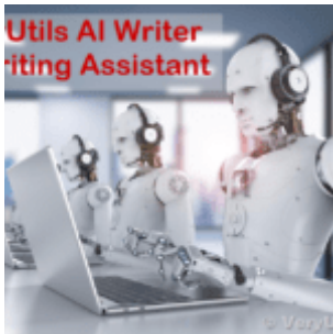
VeryUtils AI Writer is an AI writing assistant that helps you create high-quality content