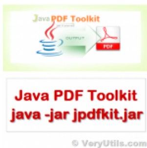
JavaStudio Software release of Java PDF Toolkit and Swing PDF Component