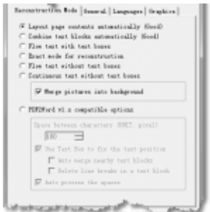
Best PDF To WORD Converter software