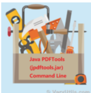
Use Java PDFTools (jpdfutils.jar) Command Line to manipulate PDF files on Windows, Mac and Linux sys...