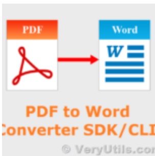
VeryUtils PDF to Word Converter Command Line for Developers Royalty Free