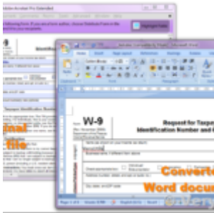
PDF to Word Conversion SDK