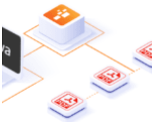
VeryUtils Java PDF Command Line SDK API for Developers Royalty Free