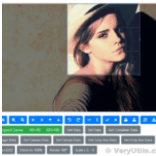
Cropping Images in JavaScript by VeryUtils JavaScript Image Cropper