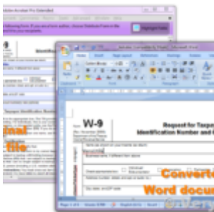
PDF to Word Conversion SDK