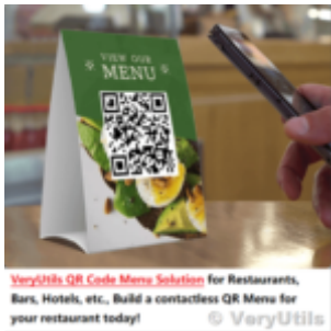
Best VeryUtils QR Code Menu platform with Online Payment Gateway Integration