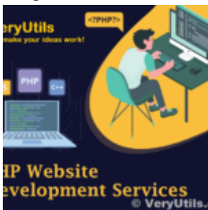
VeryUtils Custom Development Service for PHP Script Modification