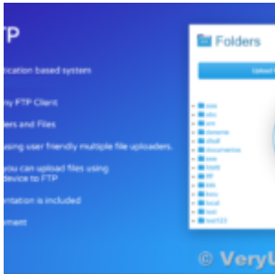
VeryUtils FTP Client Software, Automate FTP Transfers, Auto FTP Manager

The PHP appointment booking script is a highly customizable web application that allows your customers to make appointments with you via the web | 5