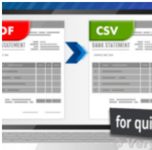
PDF to CSV Converter Command Line