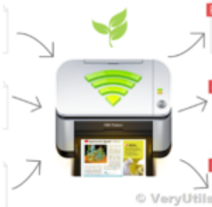
ImagePrinter Converts PDF and other office documents into various formats