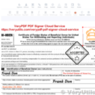
Use PDF Signer Cloud Service to Sign Any Document Online In Seconds