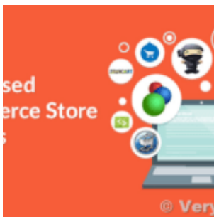
How to build an online store using VeryUtils Online Ordering System Script?