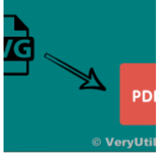
How do I convert SVG files to PDF files on Windows Server from PHP or C# source code?