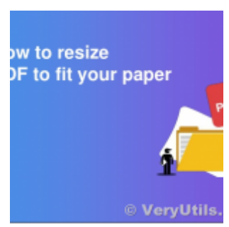
How to scale PDF content and page dimensions using PDF Page Resizer Command Line?