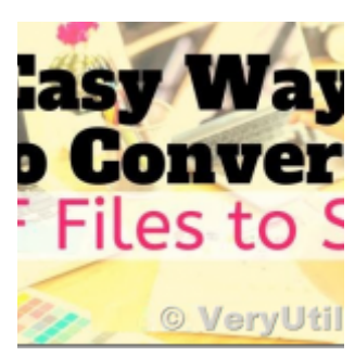
VeryUtils PDF to SVG Command-line Conversion