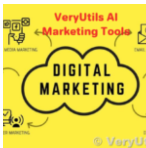
AI Marketing Tools and Software for Every Business