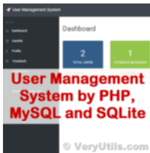
VeryUtils User Management PHP Scripts