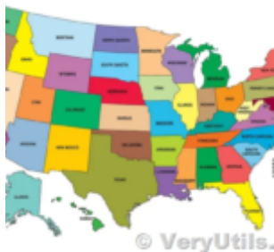
VeryUtils MapSVG jQuery - Responsive Vector Maps, Floorplans, Interactive SVG Images