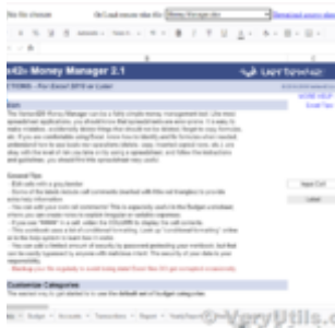
VeryUtils JavaScript Excel Web Based UI Control: The Best Microsoft Excel Solution for Web Developer...