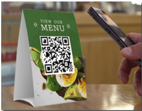
* Food packaging.

--- Print table tents that display your QR code menu, so customers can scan the QR code to view your menu on their mobile devices.