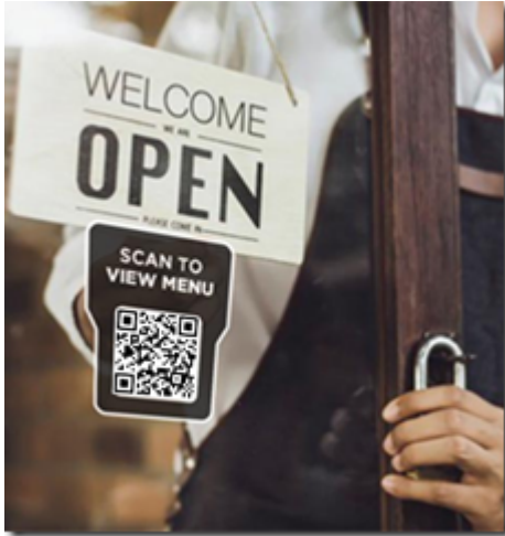
* Table tents.

--- Print table tents that display your QR code menu, so customers can scan the QR code to view your menu on their mobile devices.