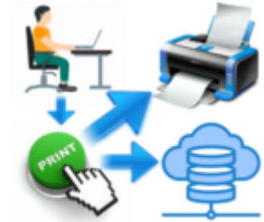
Capture Print Jobs, Convert them to PDF files, Save them to Cloud Database

Recover lost or deleted photos, videos, audio, videos, documents. 100% Recovery Rate! | 7