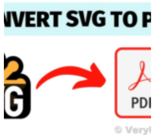
Batch SVG to PDF Converter Command Line