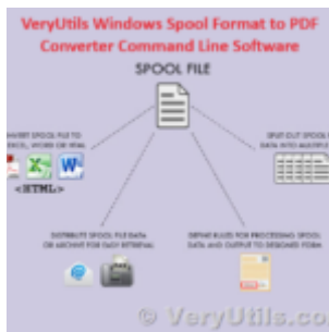
VeryUtils Windows Spool Format to PDF Converter Command Line Software

Recover lost or deleted photos, videos, audio, videos, documents. 100% Recovery Rate! | 7