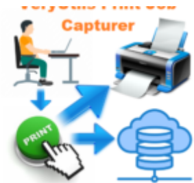
Capture Print Jobs, Convert them to PDF files, Save them to Cloud Database

VeryUtils Print Job Capturer for Print Archiving, viewing and print content capture