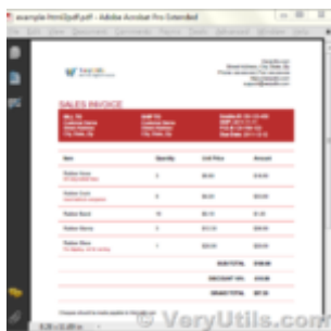
Why should you use VeryUtils PHP Invoice Generator?