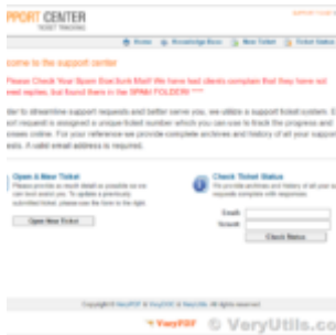
Ticket Support PHP Script