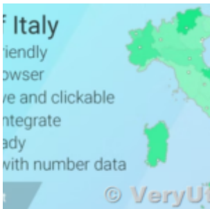
VeryUtils Interactive and Clickable HTML5 SVG Map of Italy