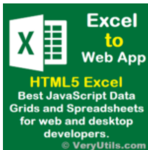
VeryUtils JavaScript Excel Control for Web Developers, Read and Write Microsoft Excel SpreadSheet (X...