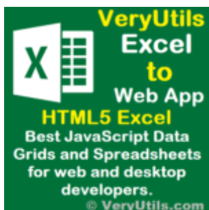
VeryUtils HTML5 Excel Sheets: Best Online Spreadsheet Editor with VeryUtils HTML5 Excel Online Web A...