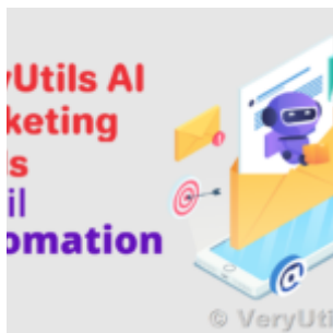
VeryUtils AI Marketing Tools to Scale Your Business in 2024