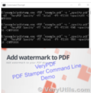
Use VeryUtils PDF Stamper Command Line to add watermark to your PDF files