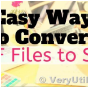
VeryUtils PDF to SVG Command-line Conversion