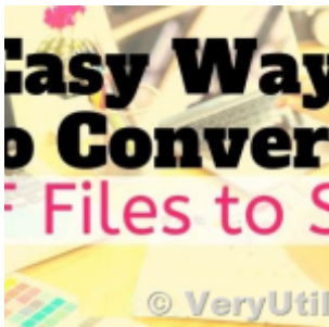
VeryUtils PDF to SVG Command-line Conversion