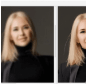
How to Increase Image Resolution with VeryUtils Photo Enhancer?