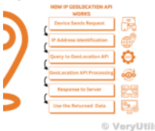
VeryUtils IP to Geolocation API: Transform Your Business with Location Data