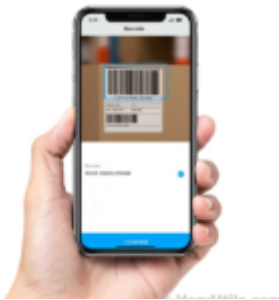
VeryUtils JavaScript Barcode Reader is a Powerful Tool for Web- Based Barcode Scanning