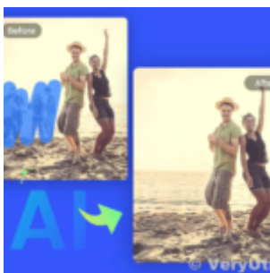
Introducing VeryUtils Photo Eraser Cloud App: Your Ultimate Solution for Object Removal in Photos