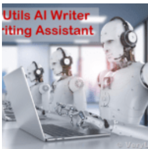
VeryUtils AI Writer is an AI writing assistant that helps you create high-quality content