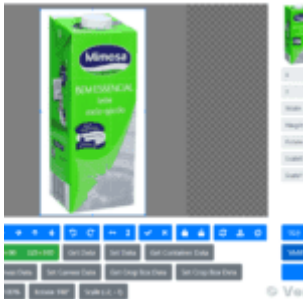
VeryUtils Image Crop and Upload using jQuery with PHP Ajax