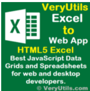
VeryUtils HTML5 Excel Sheets: Best Online Spreadsheet Editor with VeryUtils HTML5 Excel Online Web A...