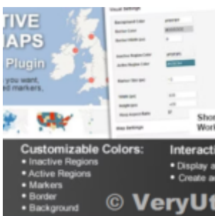
Unlocking Data Insights with VeryUtils Interactive SVG Map Component