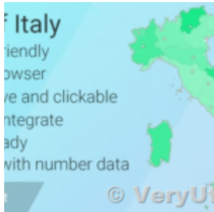
VeryUtils Interactive and Clickable HTML5 SVG Map of Italy