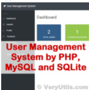
VeryUtils User Management PHP Scripts