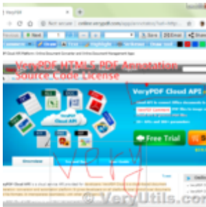
VeryUtils provides source code license for HTML5 PDF Annotation Web application