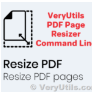
VeryUtils PDF Page Resizer Command Line can scale PDF contents and page dimensions from command line