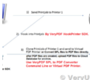
VeryUtils Print Logger is an Enterprise Print Tracking Tool and Print Statistics Software