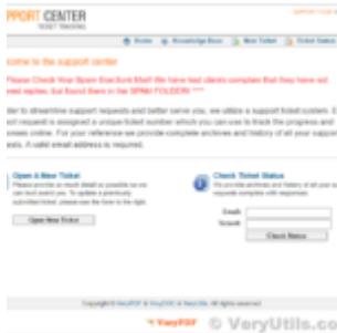
Ticket Support PHP Script