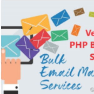
Bulk Email Marketing Web Application For Business with VeryUtils PHP Batch Email Sender