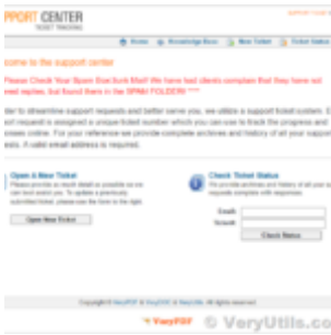
Ticket Support PHP Script