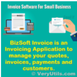
VeryUtils Online Invoices: Online Billing & Invoices Management Software