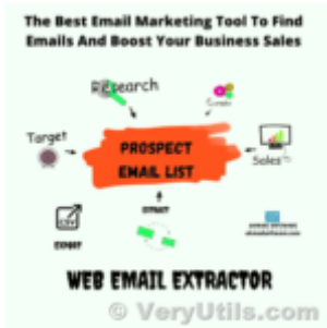
Web Email Extractor to extract email addresses