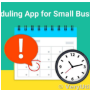
Best Appointment Scheduler software for Small Businesses