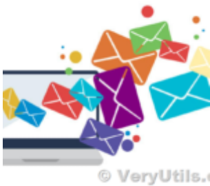
Best Mass Email Senders for Bulk Email Blasts